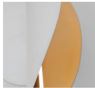
-640 White Aged Brass