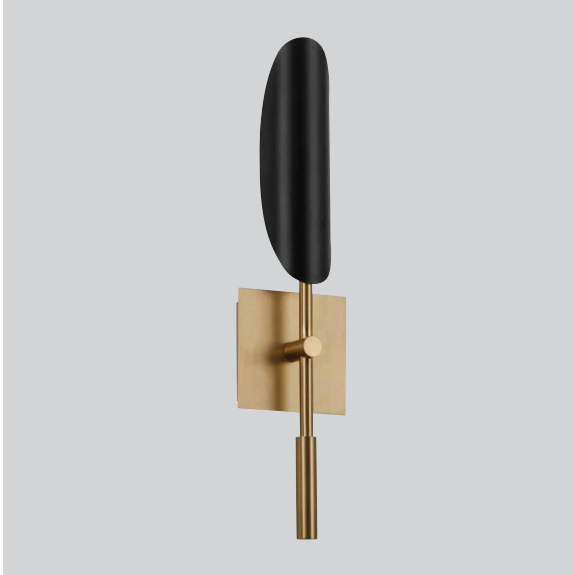
-1540 Black/Aged Brass