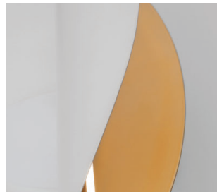
-640 White/ Aged Brass