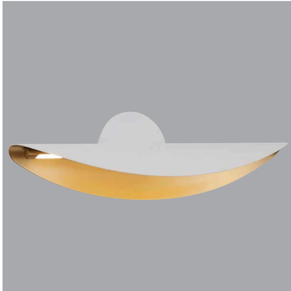
-640 White/Aged Brass