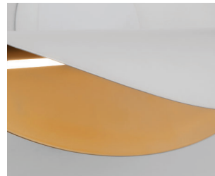
-640 White / Aged Brass