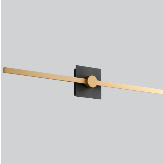
-1550 Black/Industrial Brass

FIXTURE TYPE _____ LOCATION _____ PROJECT _____ DATE _____