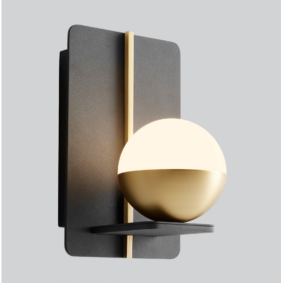
-1540 Black/Aged Brass (Lit)