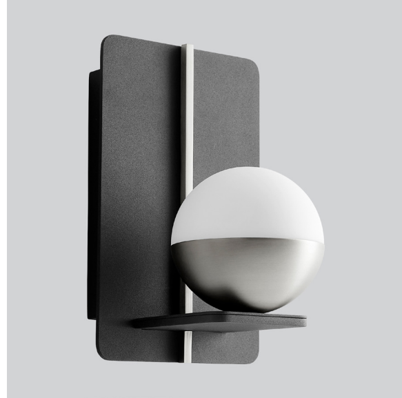
-1524 Black/Satin Nickel