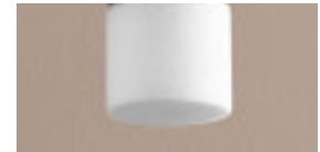
- Matte White Acrylic