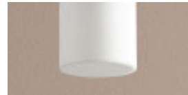
-1 White Opal Glass