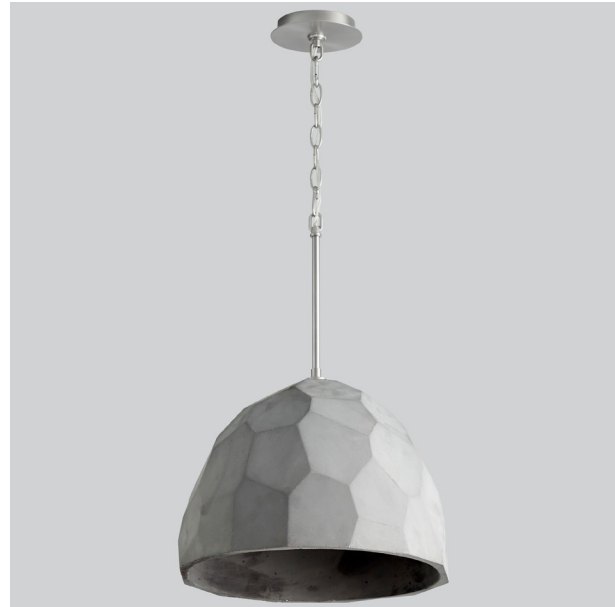
-1624 Gray/Satin Nickel