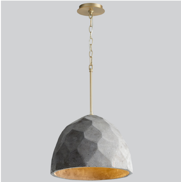
-1540 Dark Gray/Aged Brass Lit