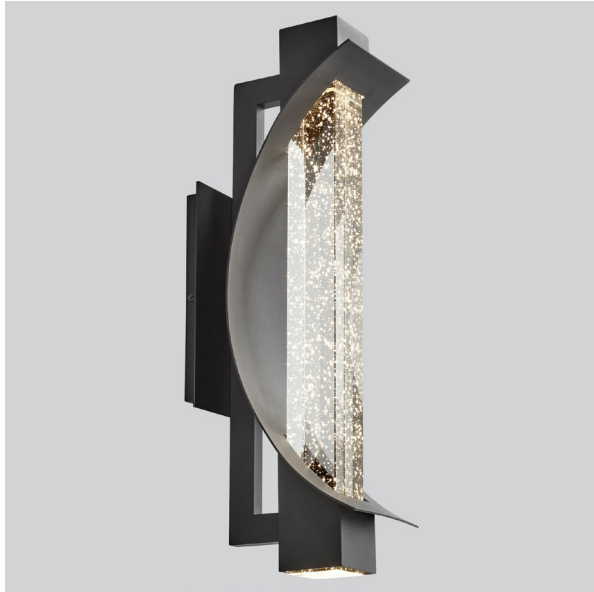
-15 Black (Lit)