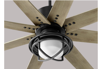
-15 Black/Weathered Gray Blades with Optional Light Kit 3-1084-15