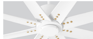
-6 White/White Blades