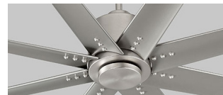
-24 Satin Nickel/Silver Blades

SPECIFICATIONS 8 ABS Blades / 56" Blade Sweep / 13° Blade-Pitch DC Motor: DC-165NM 4" and 6" downrod (Included) Optional downrods available for high ceilings 6 Speeds - Reversible with remote control 0.37A on high / 0.05A on low 28W on high / 3W on low 155 rpm on high / 50 rpm on low Handheld Remote Control (Included)