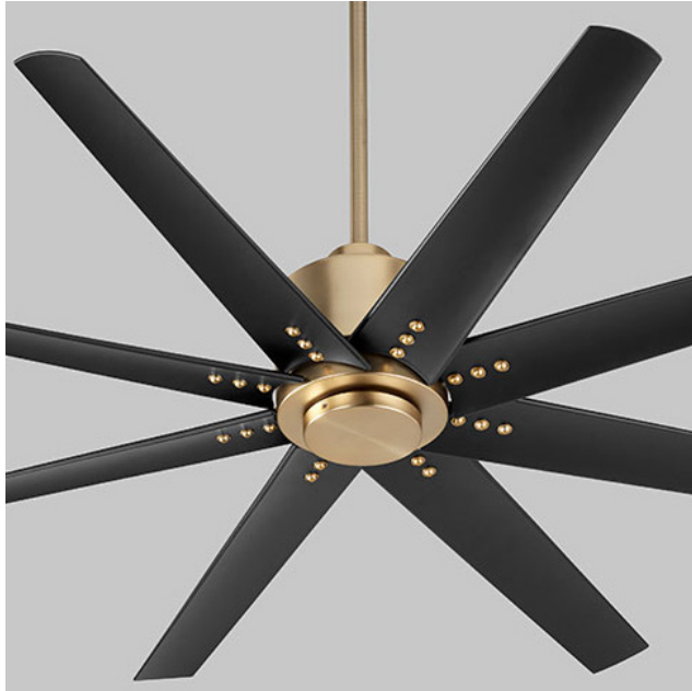
-40 Aged Brass/Black Blades