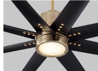
-40 Aged Brass/Black Blades with Optional Light Kit 3-9-108-40