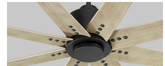
-15 Black/Weathered Gray Blades