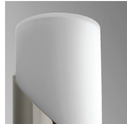
-1 White Opal Glass