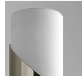
-2 Matte White Acrylic