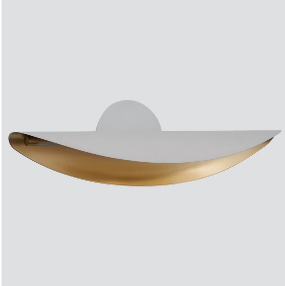
-640 White/Aged Brass